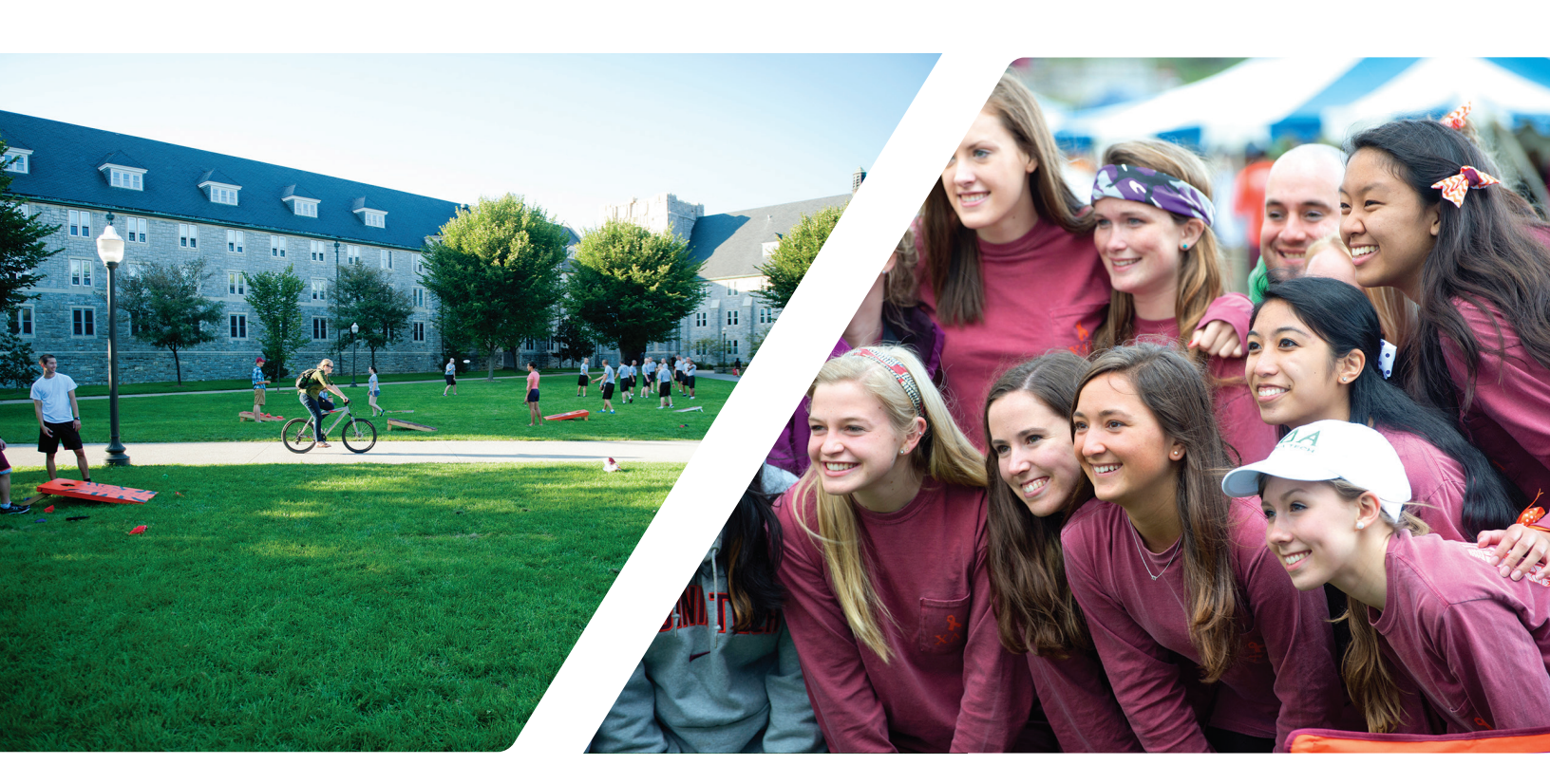
The Virginia Tech Student Experience Task Force Report | January 2015